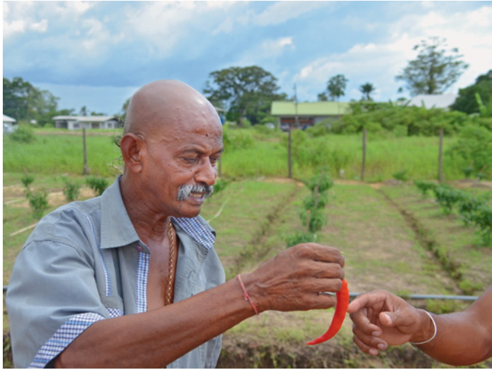
A chili pepper expert examines the harvest

Beyond that, Stichting Corantijn renovated a dilapidated government building located in the immediate vicinity of the church, and was able to develop a remarkable plan of use with the village elders: the building, which covers an area of 2000 square metres was equipped with a kindergarten, two meeting rooms for young people with a library and computer room, two apartments for village teachers, and a drying room for chili peppers, all by the end of 2018.