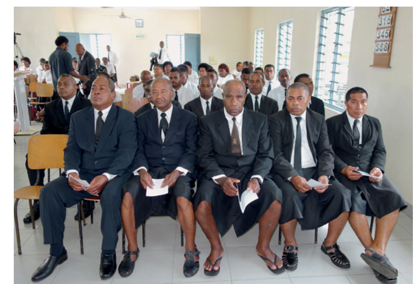
The Chief Apostle's itinerary also included meetings with Bishops and Apostles

A normal choir practice could easily be confused with a concert performance. And fellowship is also a very important element in the Polynesian culture." With a grin, he adds, "And the regular church fellowship feasts are not suited to anyone on a diet."