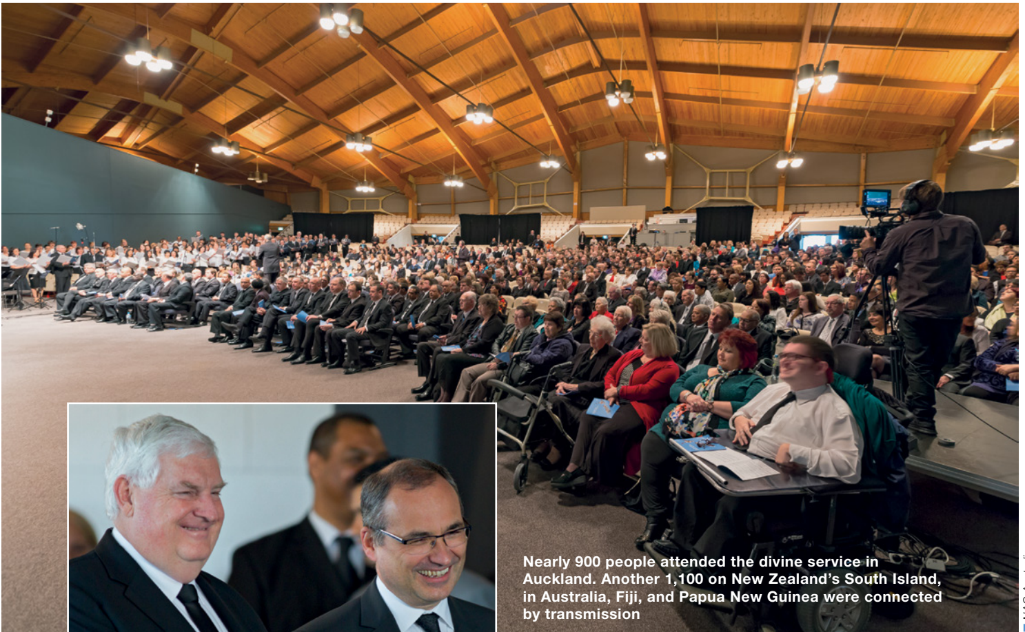
Nearly 900 people attended the divine service in Auckland. Another 1,100 on New Zealand's South Island, in Australia, Fiji, and Papua New Guinea were connected by transmission