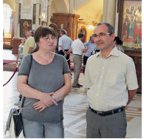
The Chief Apostle was given a guided tour of Tbilisi, the national capital of Georgia. Of the country's 4.5 million people 1,103 are New Apostolic Christians