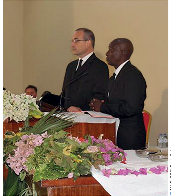
MAC RDC Stud-Est