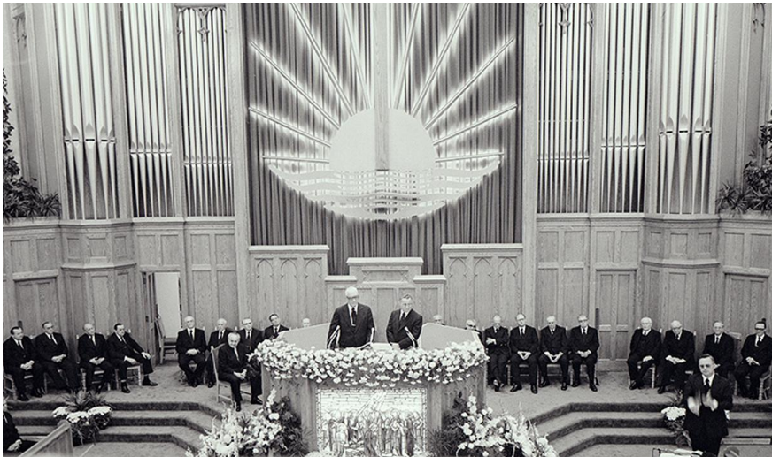
Divine service in the congregation Kitchener Central (Canada), 1977