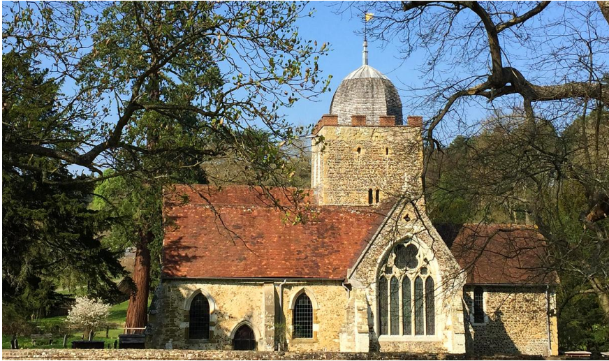
Old St Peter and St Paul's Church in Albury (England)