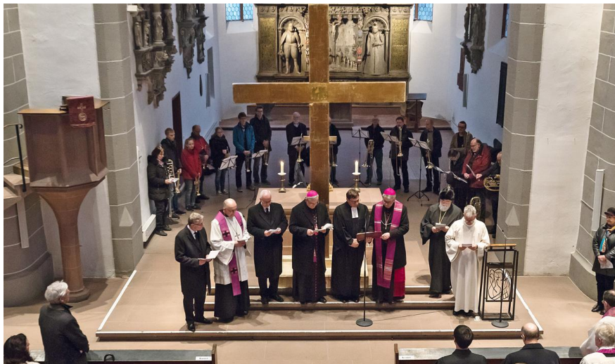
Divine service in Darmstadt (Germany), 2018