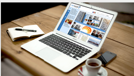
Social Media Guideline of the New Apostolic Church New Apostolic Church Hauptstadt

What exactly is meant by this and how it can be implemented is explained in the Guideline, which can be downloaded here.